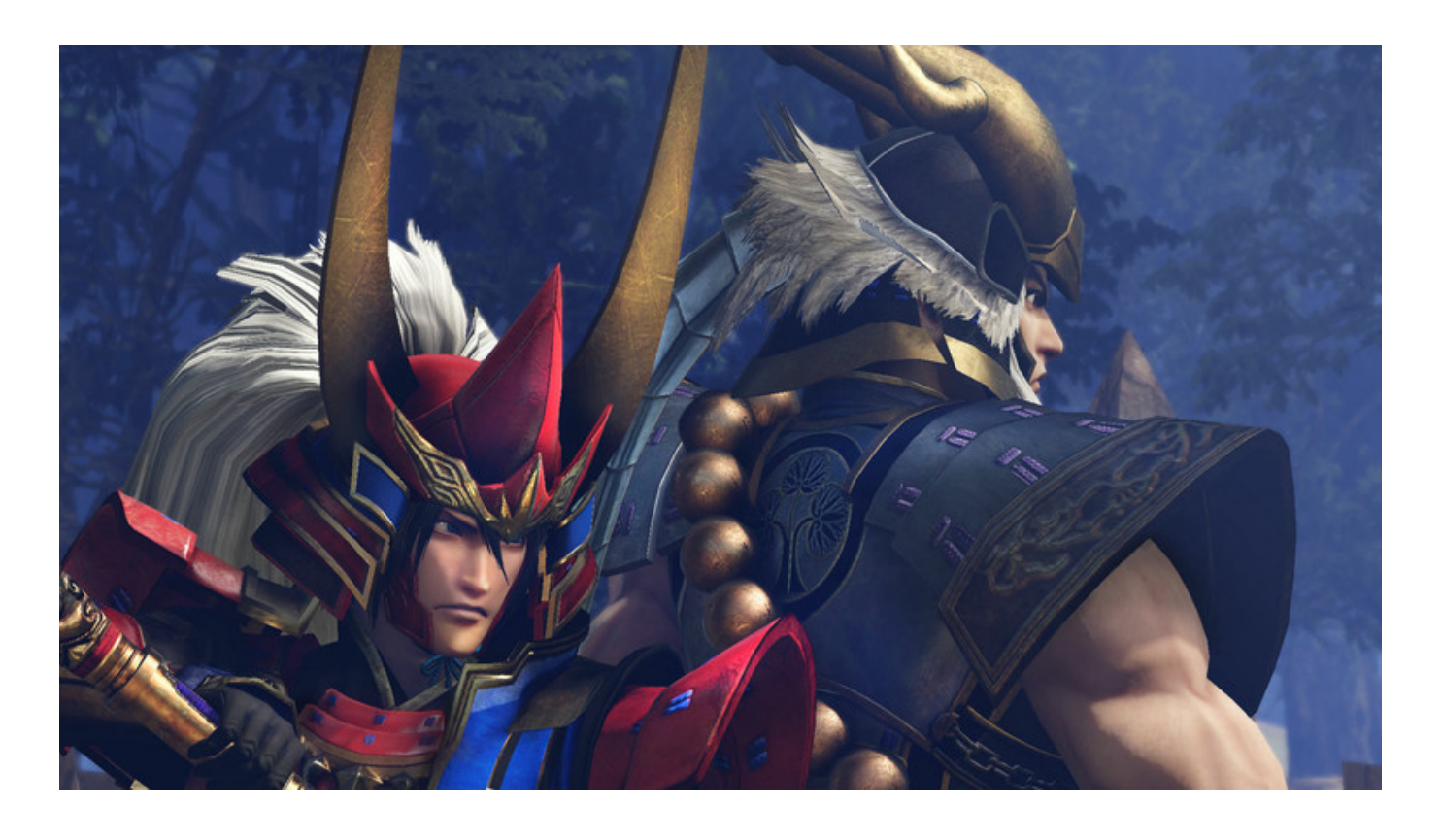
Download ->>->> http://bit.lv/2NIucly